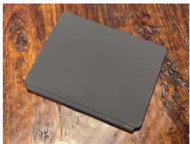
Black anodized aluminum sheet canada.

Thus, the amount of cut by complete sheets would be 20pcs. This helped Black Friday's concept became as popular as boxing and forced retailers to offer offers or lose profits and customers. Lack Friday Lines and Chaos USA Black Friday Sales are known for being caustic. Remember that the cut cost will be added to the price. For your biggest projects, we can help significantly reduce the overall cost! Specifications ON 5005H14 AALUMINUM Anodized surface is a leader in the manufacturing coil and sheet material for reflector and louver products illumination. Example. What you could not mark on Black Friday, you can find online during Cyber à € à €